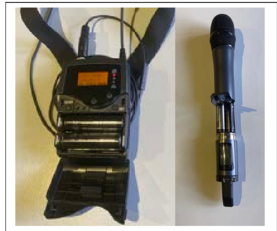
Picture 8: To change the batteries: Flip the collar microphone open; unscrew the handheld mic at the bottom

The handheld microphone and the collar microphone are each powered by two rechargeable batteries. An indicator for the battery status is located in the display of the respective device. At the end of your lecture, or when the battery symbol starts flashing during the lecture, you should replace the batteries (-> Picture 8). The charger (-> Picture 9) for the batteries is located at the control station. Here you should also always find four charged batteries. A green or red LED on the top of the charger indicates which batteries are charging -> RED; or are fully charged -> GREEN.