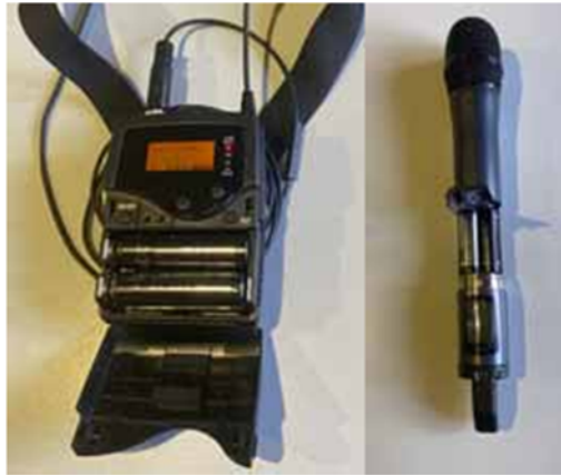
Picture 8: To change the batteries: Flip the collar microphone open; unscrew the handheld mic at the bottom

The handheld microphone and the collar microphone are each powered by two rechargeable batteries. An indicator for the battery status is located in the display of the respective device. At the end of your lecture, or when the battery symbol starts flashing during the lecture, you should replace the batteries (-> Picture 8). The charger (-> Picture 9) for the batteries is located at the control station. Here you should also always find four charged batteries. A green or red LED on the top of the charger indicates which batteries are charging -> RED; or are fully charged -> GREEN.